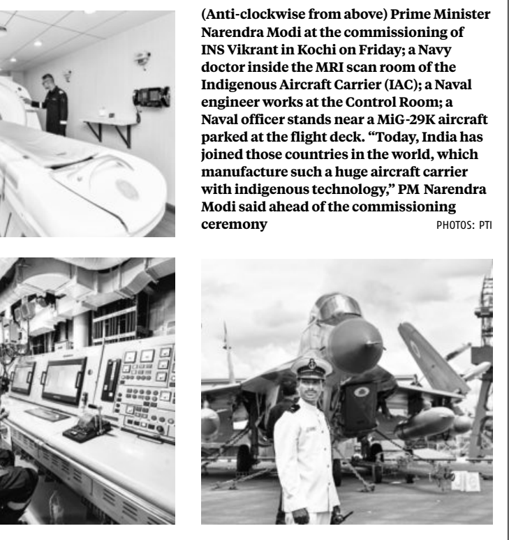
(Anti-clockwise from above) Prime Minister Narendra Modi at the commissioning of INS Vikrant in Kochi on Friday; a Navy doctor inside the MRI scan room of the Indigenous Aircraft Carrier (IAC); a Naval engineer works at the Control Room; a Naval officer stands near a MiG-29K aircraft parked at the flight deck. "Today, India has joined those countries in the world, which manufacture such a huge aircraft carrier with indigenous technology," PM Narendra Modi said ahead of the commissioning ceremony.